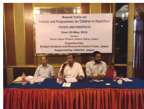
Round Table on Policies and Programs for Children in Rajasthan

The round table discussion focused on the different aspects of Policies and Programmes related to Social Sector with special reference to Women, Children and the marginalized communities in the state. BARC Trust is also in process of publishing a report of the Round Table, which can be used as resource material by various organisations working with children and for development and welfare of children in the state.