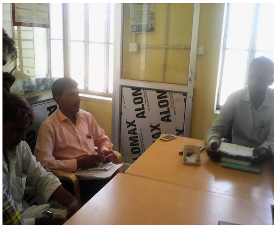
Field Facilitators meeting with the Sarpanch in Malpura Block

Providing Support to Tonk Panchayats: BARC Trust entered into a partnership with UNICEF, Rajasthan to work on a one year programme, which could be extended to another year, to provide support to the panchayats in two blocks of Tonk District – Malpura and Todarai Singh – in planning, implementation and monitoring of their activities. One component of the project also aims at conducting a comprehensive survey among the panchayats in order to rank their performances. The project just started in March, by the end of the reporting year and it will be majorly implemented in the next financial year.