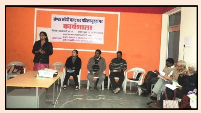
Issue based meeting on Gender Budget, Kota, January, 2013

Another issue based meeting was organized on 'Gender Budget in Rajasthan' by BARC in collaboration with Ekal Naari Shakti Sangathan, Kota on 8<sup>th</sup> January, 2014. In this meeting, the participants were made familiar with the concept of gender, status of gender budget in the state and problem related to women such as domestic violence. More than 30 people participated in this meeting.