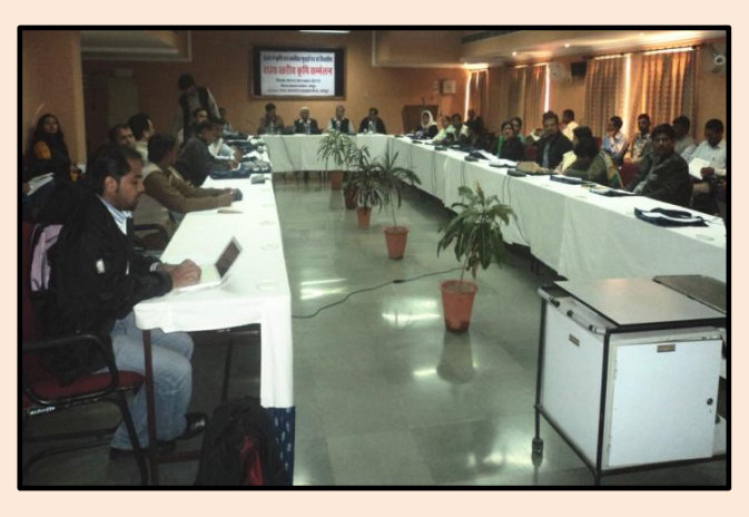
Agriculture Conference, Jaipur, November, 2013

For last four years BARC has been conducting an agriculture conference every year. The last conference was organized on 25<sup>th</sup> and 26<sup>th</sup> November, 2013 in Jaipur. About 70 participants from 8 districts attended the conference. The objective of the conference was to discuss the issues and problems related to agriculture like the present status of agriculture in Rajasthan, climate