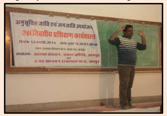
Issue based meeting on SC-SP and TSP, Udaipur, Januar, 2014

During the year 2013-14, BARC organized following issue based meetings: