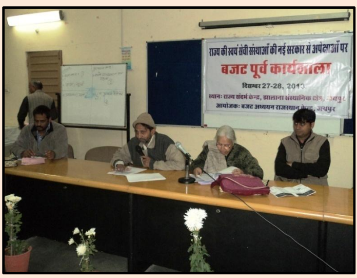
Pre -Budget Consultation, Jaipur, December, 2013

As part of pre-budget advocacy efforts, BARC organized a pre-budget consultation of NGOs on December 27<sup>th</sup> and 28<sup>th</sup>, 2013 to discuss the issues of concern as well as expectations and suggestions for the Budget 2014-15. More than 60 participants from various parts of Rajasthan were present in the consultation and a memorandum of demands was prepared with primary focus on issues related to health, women, children, dalits, tribals and rural development. This document was then presented to the Chief Secretary, Department of finance and other