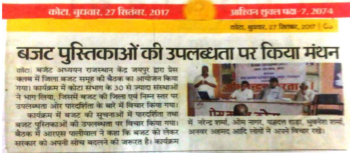
Image: Kota DBG meeting covered by Dainik Bhaskar, 27th September, 2017

transparency in budget at district level, intervention at district level by getting people's needs included in the budget of Zilla Parishad, Department Budgets and Gram Panchayat budget, especially the needs of the deprived sections of the society. (Repeated in Bikaner DBG Point as it is)