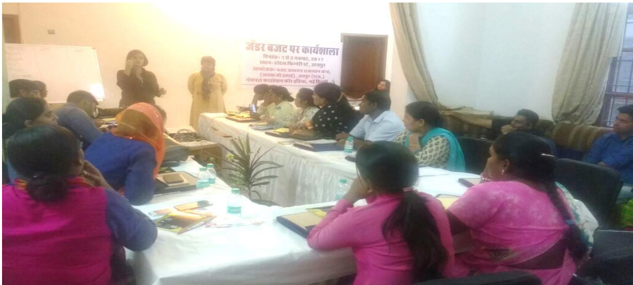
Image: Workshop with CSOs on GRB, held on 1-3 November 2017

A total of 4 workshops were conducted under this activity on 3 rd June, 26 th July, 4 th August and 28 th September in the year 2017-18 respectively.