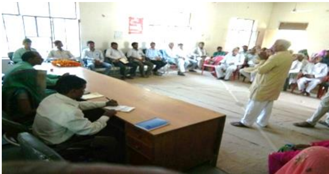
Image: KAS's teams visit to Alwar, hosted by Sohard on 29 th September, 2017

c) Field Visit by Udaipur Team (Along with ERs) to Alwar: A field visit of the Gram Panchayat members as well as KAS members from Kotra, Udaipur was organized by Sohard Sansthan in Alwar on 29 th September 2017. During the field visit the members from Udaipur along with the Sohard team visited Majra Gram Panchayat in order to meet the ERs and people of the village. There they met the Sarpanch, Upsarpanch and few ward panchs. Along with this, they visited the village and conducted a meeting with the people of the village in order to understand the working of Majra Panchayat.