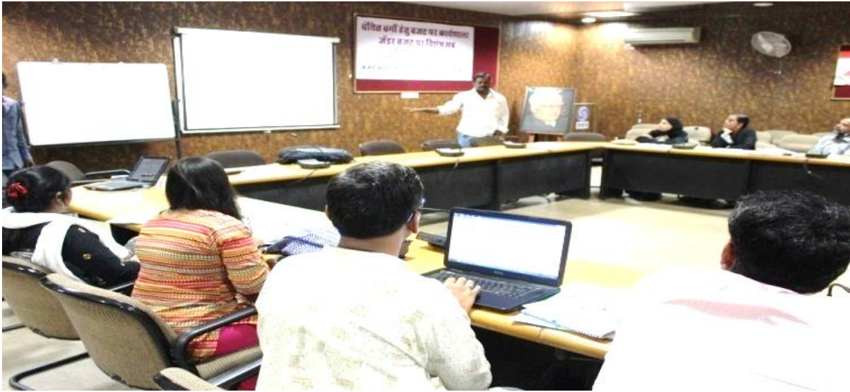
Image: Second workshop on budget for social activists in Rajasthan held on 28-29th September, 2017