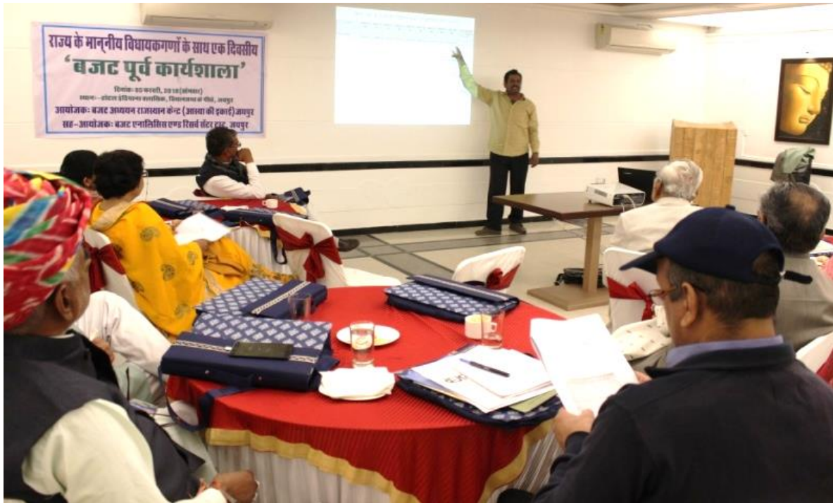
Image: MLA Orientation Held on 5th February, 2018

Pre-Budget Workshop with MLAs: Before the budget 2018-19, BARC organized a pre-budget workshop with MLAs of Rajasthan on 5 th February, 2018. Around 35 participants including 12 MLAs and people from different organizations, NGOs, media houses participated in the workshop. The purpose of the meeting was to discuss the trends of state economy and budget allocation and expenditure of the government over the past few years and to give suggestions for the upcoming budget. Also the issues related to budget of different socio-economic sectors/groups could be raised by them in the state assembly.