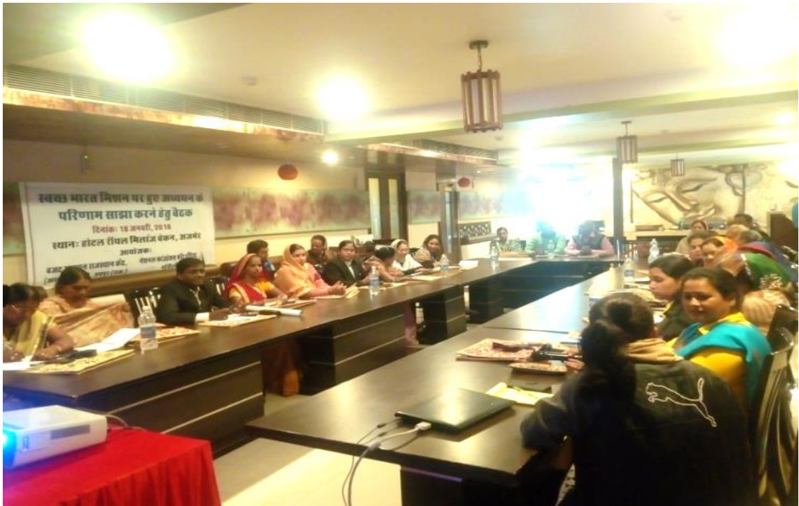
Image: State level consultation (Findings sharing meeting)? held on 18 th January 2018