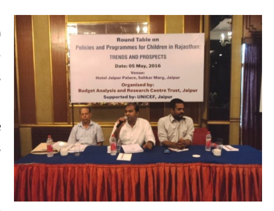
Round Table on Policies and Programs for Children in Rajasthan

The round table discussion focused on the different aspects of Policies and Programmes related to Social Sector with special reference to Women, Children and the marginalized communities in the state. BARC Trust is also in process of publishing a report of the Round Rajasthan